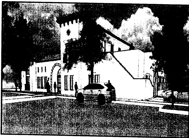
Architectural drawing of new City Hall

We continue to negotiate a contract with Guido Brothers Construction and look forward to groundbreaking around November 1. Construction of the Police Station/ Administration